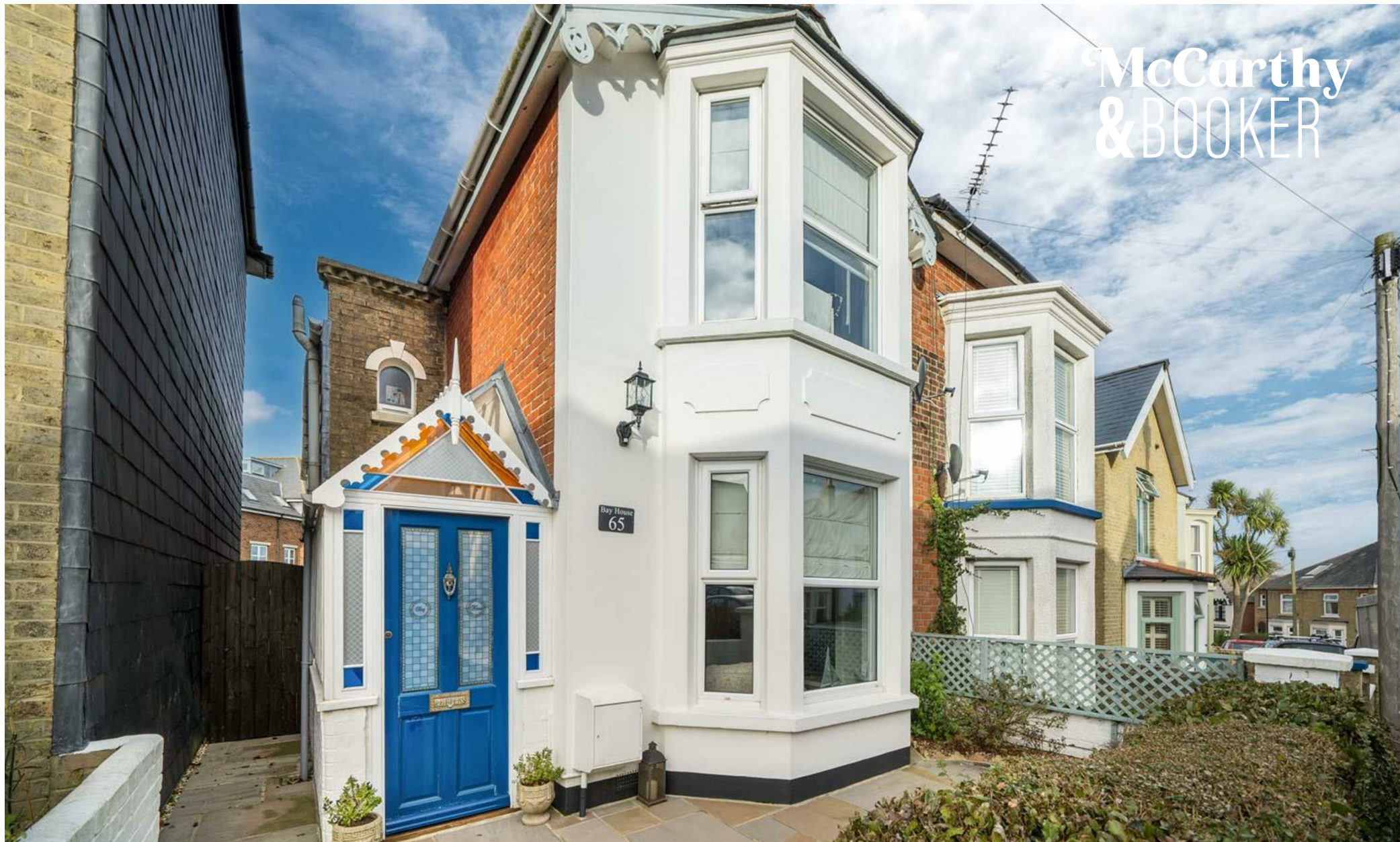
Bay House 65 Bellevue Road, Cowes, Isle of Wight, PO31 7HJ